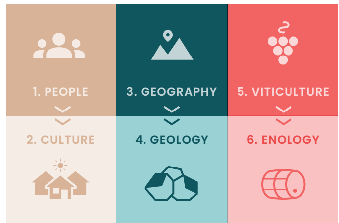
SIX WINE STORIES MODEL

The effectiveness of this model is clear. You can expect a 400% increase in audience engagement when using this framework, which means your story reaches and holds the attention of your target audience.